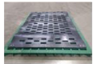
Comfort Cushion Starter Mat for Newborn Calves