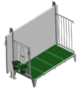
0.8M (30") X 1.6M (63") with 5L Buckets

The VES-Artex Raised Calf Zone System features a steel plate base with a steel lip that safely secures the floor panels in place and makes installation and cleaning easy.